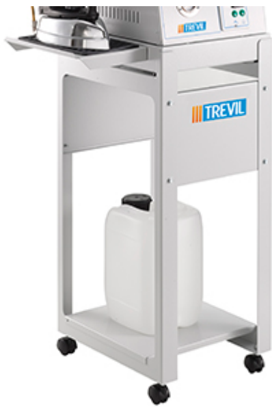
Refill tank included