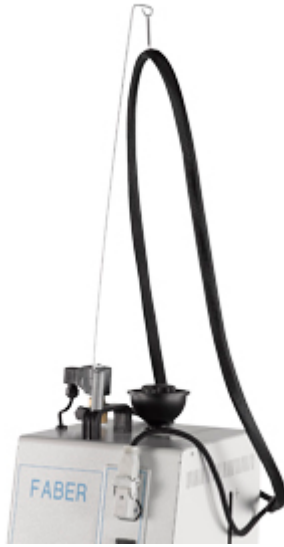
Cable holder rod