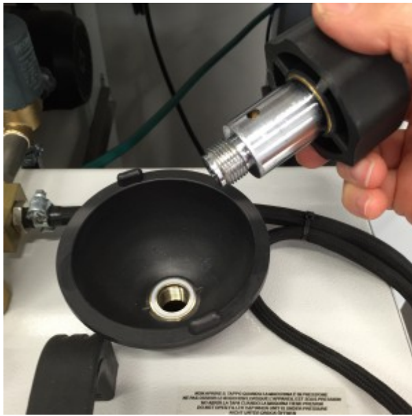
Built-in refill funnel