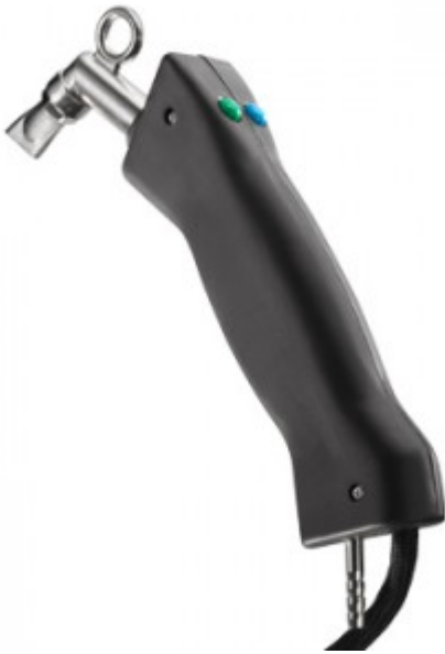
Stainless steel spotting arm and steam/air gun for hot spotting